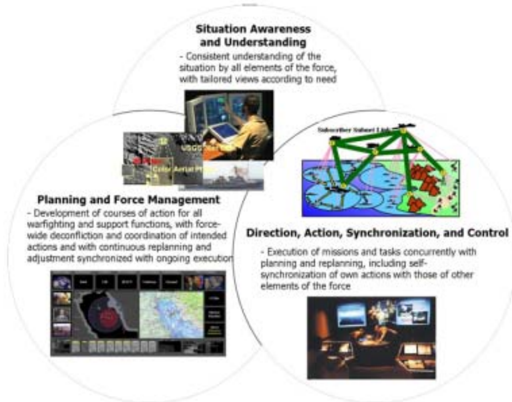
Figure 2. “Operational Capabilities for Net Centric Operations”

The five NCO enabling functions to support FORCENet are listed below: