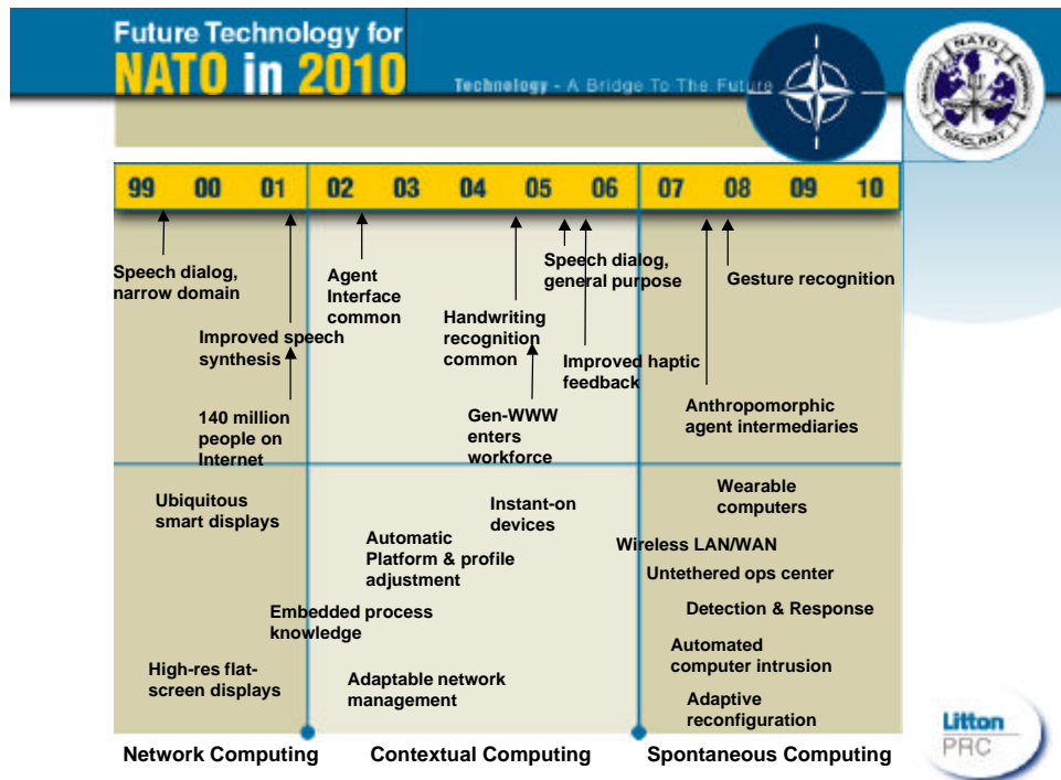
Figure 7 Specific IT Trends