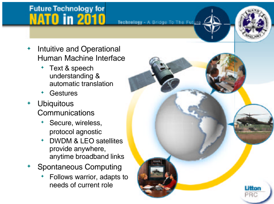
Figure 5 Trends & Capabilities for the NATO of 2010 Technology Needs