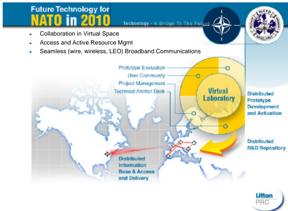
Figure 1 A View of the Future Technology Picture