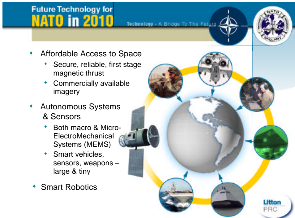
Figure 3 Additional Needs for the NATO of 2010