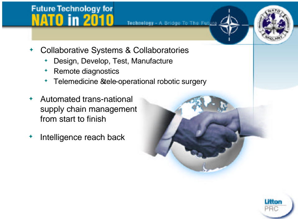
Figure 6 Trends & Capabilities for the NATO of 2010

NATO will also need improved means to work together in a coalition environment to accomplish the complex needs shown in Figure 6. Rapid technological change, along with the demise of the Soviet Union, will present NATO with types of threats that are too complex for any individual or small group to manage. These threats include multiple civil wars, ethnic strife, cyber terrorism, and biological warfare.