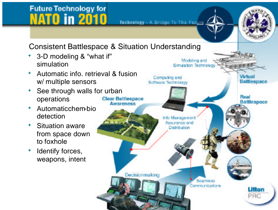
Figure 4 Trends & Capabilities for the NATO of 2010

Major technology components and capabilities for NATO in 2010 are depicted in Figure 4. The seamless communications will need to be combined with advanced, 3-D models and simulations to provide DVEs driven by fusion of information from multiple sources, resulting in consistent situation understanding, ranging from space down to the foxhole. There will be a need for "see-through walls" capability for urban operations. The battlespace understanding displays must provide not only clear views of the operational environment, but also the determination of enemy intent. Modeling and simulation must provide the capability to perform dynamic "What if" alternative analysis to see what different ranges of enemy capabilities and tactics will affect the likely outcome of NATO tactics and capabilities.