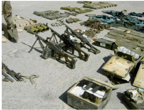
Photo 1.0 INS Weapons

Where it concerned the economic dimension, the local economy was based on the agricultural produce of the areas, which for the most part was poppy, corn, hash, and wheat. The produce would be sold or delivered to a number of dispersed rural markets of collection points for transport to the urban centers. Therefore, in terms of local economy, it usually reflected the agricultural cycles of the area. As much of the land was rented, the majority of those working the fields had very little money, even after the produce was sold. Where it concerns poppy and narcotics, the farmers were those in the narcotics production chain who made the least.