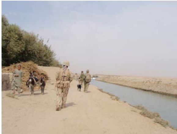
Photo 6.0 Dogs & FoM

Common INS SAF TTPs. The INS relies primarily on short engagements with small arms to delay CF operations on the ground. They do this primarily by compensating for his lack of firepower and numbers by conducting omni-directional shooting at CF fixed positions or patrols being tracked while they are static (holding a pause for example.) Though the engagements are usually very short, the INS does have to use some time in organizing these short attacks and find it difficult to do so when they cannot track all independent units in the vicinity. Often automatic fire will be used to generate initial confusion and/or conceal a sharp shooting effort, or is combined with a remotely detonated IED of some sort. There is usually no follow through after the first minute, and INS are already in the process of dumping weapons and suspicious equipment, then blending in with the LN. They are however quite capable of adapting quickly to targets of opportunity, this could be rear units of withdrawing CF forces, or CF units they deem to be sufficiently isolated to risk a short harassment attack. INS combines these “shoot & scoot” tactics with their effective use of a reconnaissance screen that may include LN.