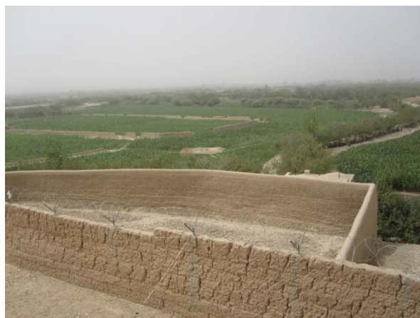
Photo 2.0 Small Roads & Paths

The only form of local information is radio and only very few members of the community have access to it. Literacy rates are close to zero in the area so the LN are very dependent on the Mosques and their characteristic speakers for mass information delivery. The use of the mobile phones however, is widespread throughout the area but subject to daylight hours because of mast restrictions during the night. However GSM is the most effective communication for INS, and in this regard they have a tremendous advantage over CF.