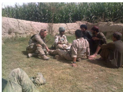
Photo 12.0 Who Sits Where