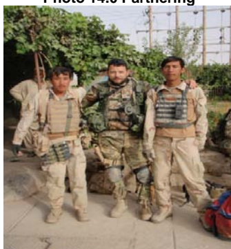
Photo 14.0 Partnering

The ATF was a game changer in a way that cannot be described completely in this paper, it not only changed the fortunes of CF in our AO, it changed the fortunes of GIRoA with the LN through their professionalism. Therefore this process of unit construction should be subject to effects analysis, and this of course will dependent on the environment into which the unit must act. This is another argument that traditional military organization where it concerns the construction of units must learn to facilitate this process by adopting a flexible doctrine of unit formation at home. 12 This of course will be a great challenge as a