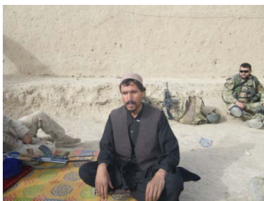
Photo 10.0 Afghan Face