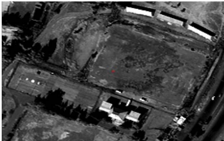
Figure 1: CIB1 Image of Complex

purpose cannot be determined from the image. A Buckeye image of the same complex is shown in Figure 2. The image clearly shows sports facilities and bleachers, strongly suggesting that the compound is not a military target.