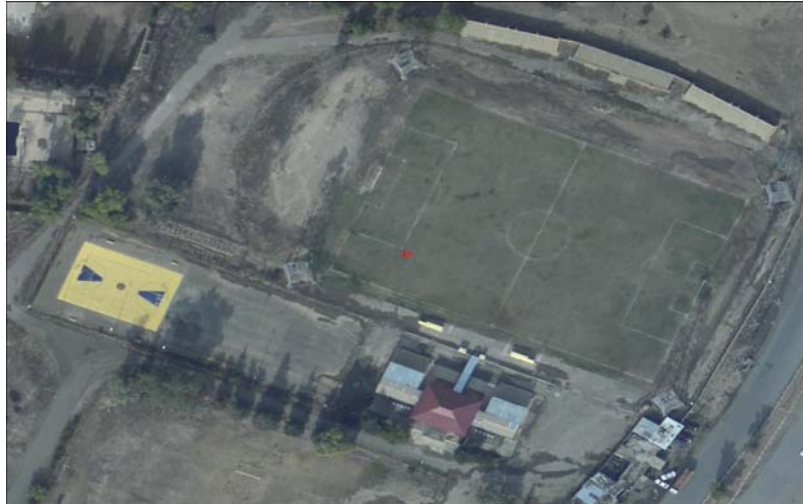
Figure 2: Buckeye Image of a School

The evaluation of imagery and elevation data in a mission specific context requires a series of decisions and judgments based on written policy and experience. This experiment captured the impact of higher resolution data on